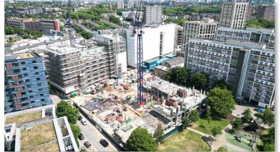
View over NWCC West (Woodhouse Urban Park at right)

Peel Phase 4 and NWCC East are continuing to progress well, with the first homes in these sites due to reach completion at the end of this year. Brickwork is nearing the top of both buildings, and in the meantime the internal fitout is progressing, including dry lining (plasterwork), joinery, bathrooms and kitchens. 'Scaffold strike' is due to take place later in the summer, which will reveal these buildings in near-final form.