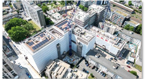
View over Peel Phase 4 and NWCC East