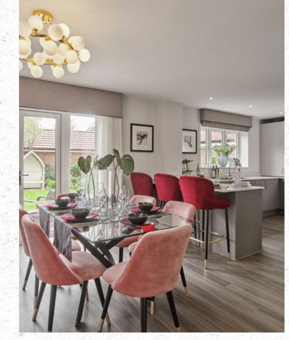
Indicative photography. Specification may vary from that shown

EVERY HOME AT WOLSEY PARK DELIVERS WELL-PROPORTIONED, FLEXIBLE LIVING SPACES THAT BOTH WORK INTUITIVELY AND APPEAL TO THE SENSES AS YOU